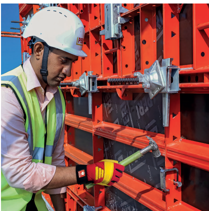
Wedge Clip and Alignment Clamp are available to connect panels in an efficient and cost-effective manner – according to your individual needs.

The sloping, thick profiles and superior steel quality make HANDSET Alpha durable and easy to repair, reducing maintenance costs. Few components and reusable powder coated panels minimize onsite material losses as well as timber wastage. In that way, common hassles on the jobsite can be avoided, for example: search times for items, missing system parts, return problems as well as costs for waste and material management.