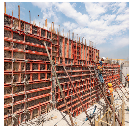
Multi-purpose panels with integrated tie holes every 5 cm allow for more flexibility in multiple wall and column applications.